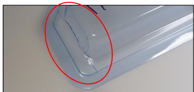
Fig. 2 Outer tray damage