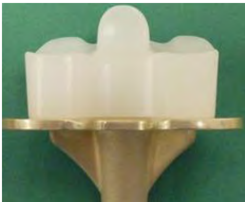
Figure 1: Correctly assembled

We were informed that the Meniscal Component, NX853, E.MOTION PS PRO MENISCAL COMPONENT F3L 20MM, could not be placed completely on a Tibia Plateau (see figures), during a surgery.