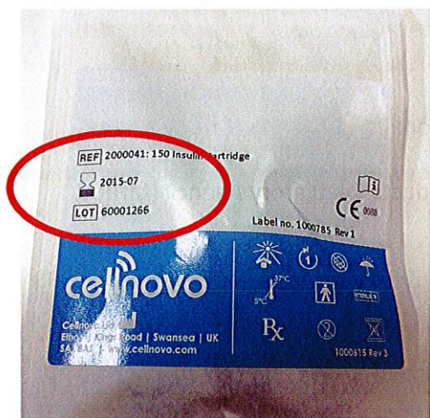
Insulin Cartridge Pouch

The Batch Number [LOT] is printed onto the label of your Insulin Cartridge pouch or Supply Kit Carton as shown: