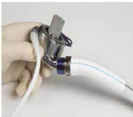
Correct: Fully Connected