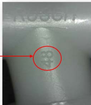
Figure 2 – Identification number (ID)