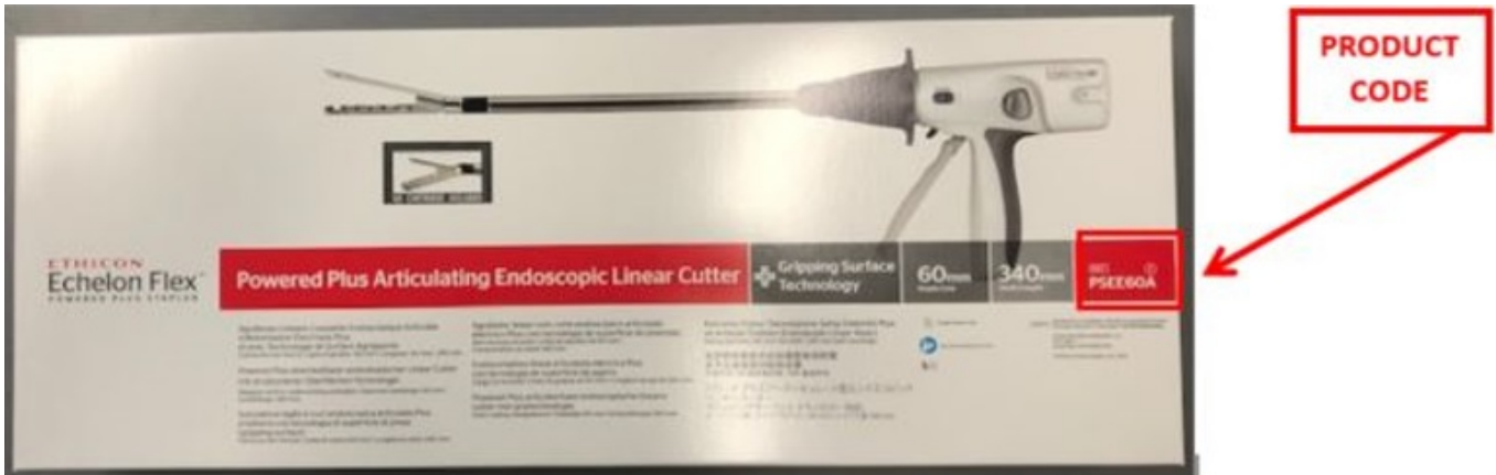
Label on Single Unit Carton