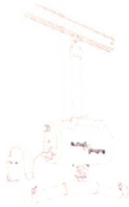
Multirall 200 attached to S65 rail carriage hook