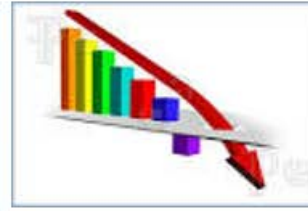
Returns, Shipment accuracy and efficiency