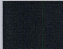
Sicherheitsbeauftragter für Medizinprodukte

Adresse novacare® gmbh Bruchstraße 48 D-67098 Bad Dürkheim